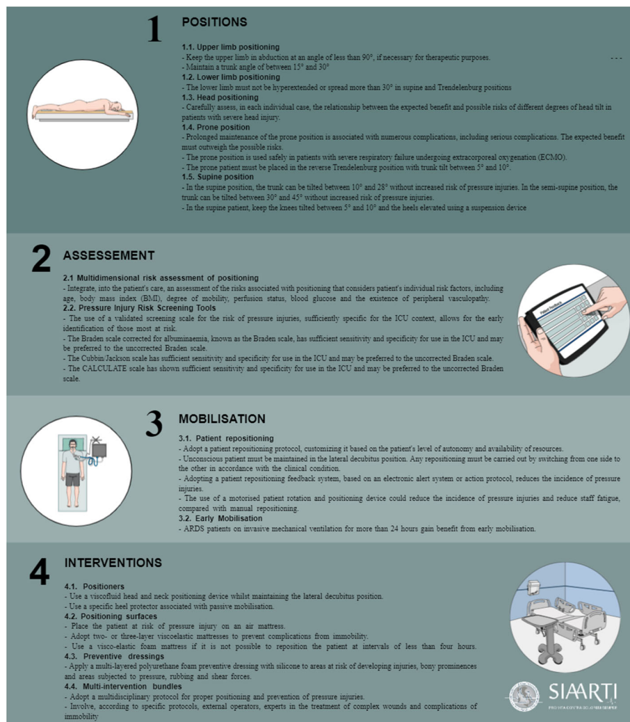
Fig. 1 The figure represents a graphical summary of the experts' statements

patients with acute respiratory distress syndrome (ARDS) [14]. Mortality is further reduced when prone positioning is combined with low current volume ventilation and when it is undertaken less than 48 h after the onset of the clinical condition [14–18].