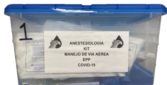
Fig. 3 The COVID-19 dedicated airway box used for airway management and placed close to patient together with the aerosol box

procedure was performed after positioning the patient, and once the AB was placed above the patient's head, with adhesive tape used to mark AB position and to secure it. A dedicated airway box was prompted close to the patient (Fig. 3) and after 3–5 min of preoxygenation performed with a Waters circuit with double filters