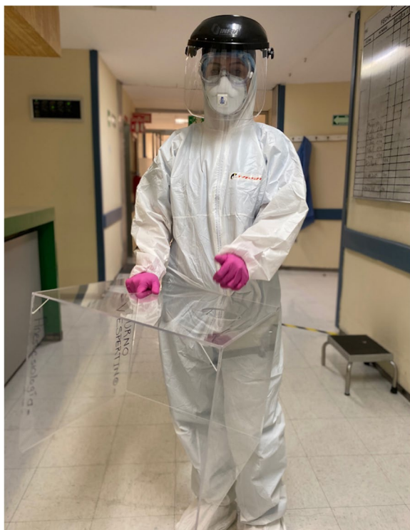
Fig. 1 Anesthesiology with personal protective equipment and aerosol-box prior to intubation of a COVID-19 patient

Airway evaluation was briefly performed before initiating the airway instrumentation procedure; this approach was maintained also in case of emergency intubations, taking account that expert anesthesiologists were always included in the airway team. Strategies to optimize peri-procedural oxygenation were undertaken during airway evaluation and patient's preparation. The intubation