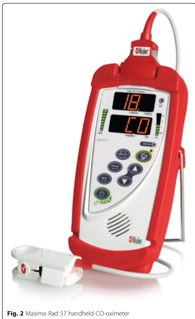
Fig. 2 Masimo Rad 57 handheld CO-oximeter

the non-invasive meter [27]. To date, the reliability of the handheld CO-oximeter is not unanimously proven but it certainly contributes to reducing the risk of misdiagnosis. It is always recommended to perform a measurement of carboxyhemoglobin on a blood sample to confirm and give more valid data for the diagnosis. Thom and others advise to always perform this blood chemistry analysis before deciding on a possible transfer to the hyperbaric chamber [21].