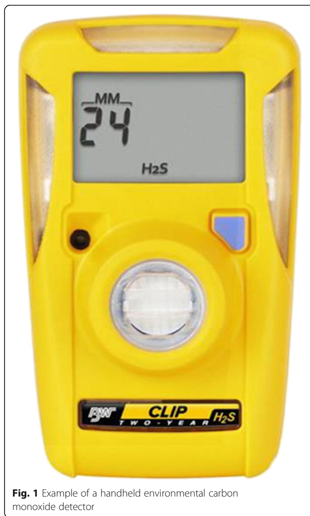
Fig. 1 Example of a handheld environmental carbon monoxide detector

Many emergency teams are equipped with environmental detectors (Fig. 1) that measure the concentration of carbon monoxide in the air. This represents an